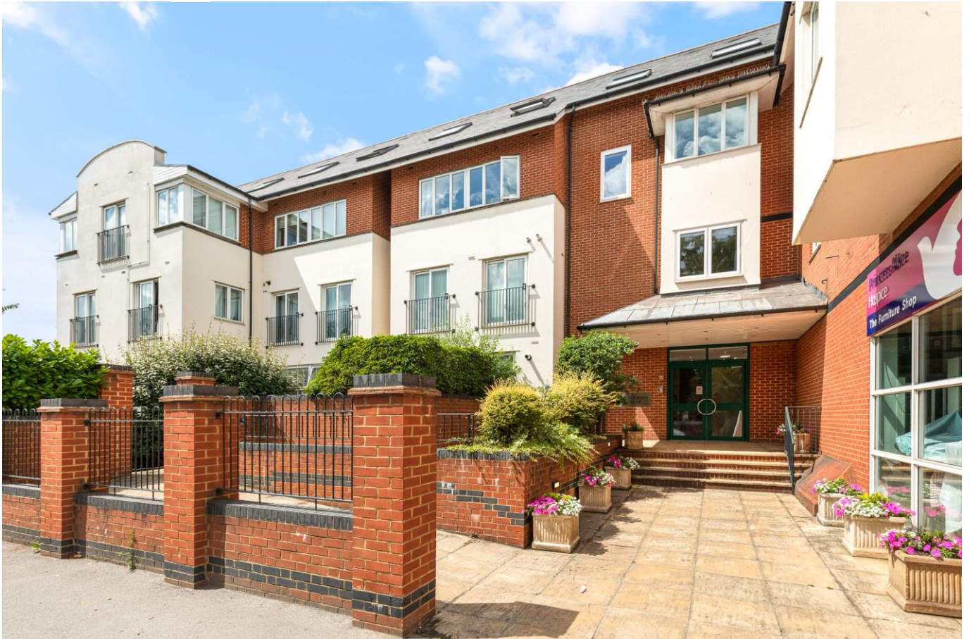
28 St Clements House Church Street Walton-On-Thames Surrey KT12 2QN